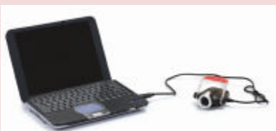
autoCam connected (by USB) to a PC

In case of accident or sharp braking, rapid curving... triggered by adjustable G-thresholds (or if triggered manually) the recordings of the last and next 20 seconds each are stored in a file together with time and date, which can be easily identified and analysed later on.