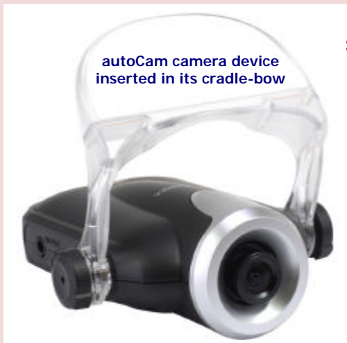
autoCam camera device inserted in its cradle-bow

automotive driving recorder (with integrated PC-software)