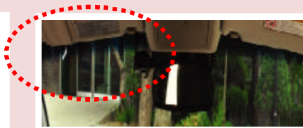
camera fixed at the windscreen records continuously as long as powered by 12V /24V